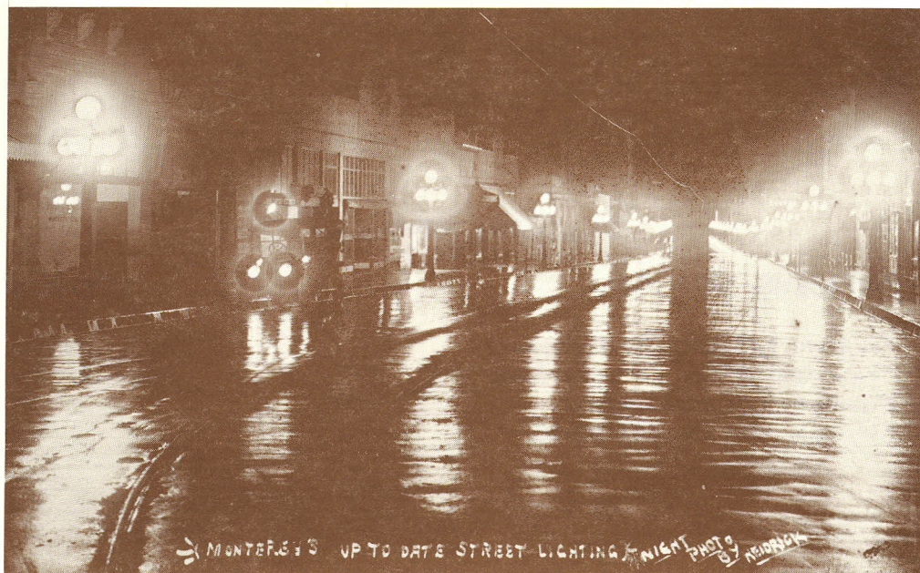
Christmas Decorations, Alvarado Street, 1920's or 1930's.