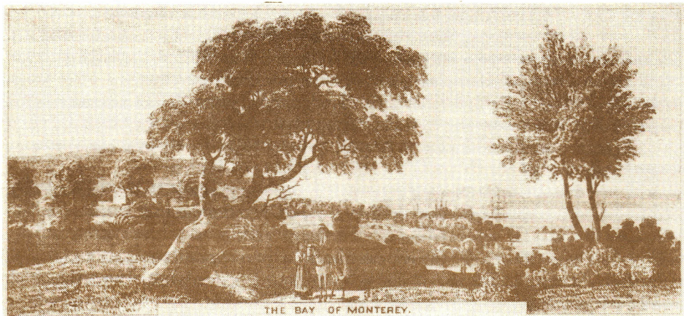
From History of Monterey County.